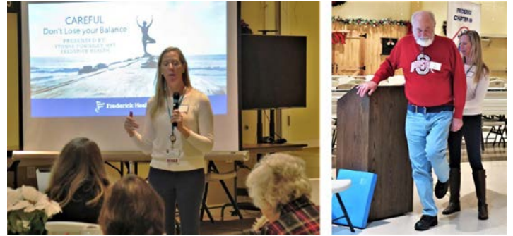
Below are photos of some of the chapter members and guests who turned out for the fellowship, meal, and presentation.